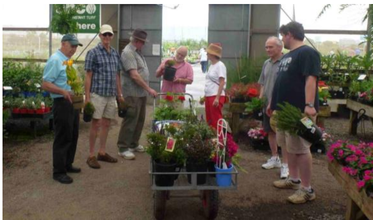
Above - A loaded trolley at the Plantmark nursery visit.