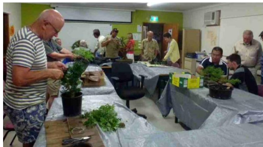
Above - some of the activity at the February Workshop night.