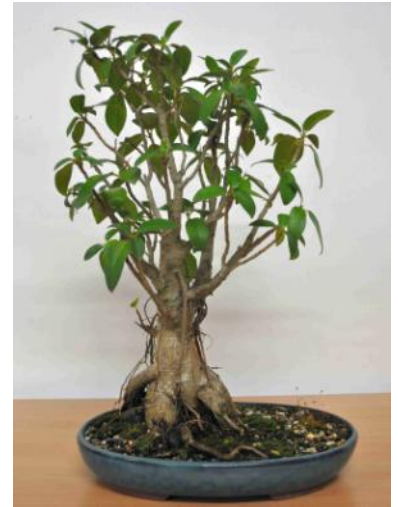
A selection of trees on the Display Table at the January and February meetings.