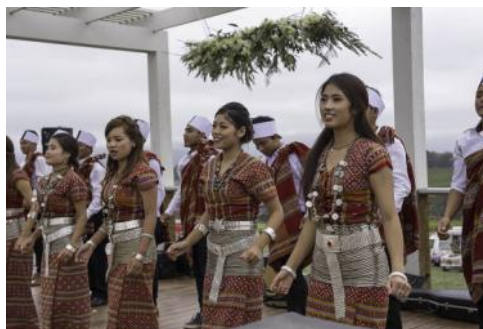
Above and left - scenes from the 2016 Benvenuti Festival; Below - the beautiful views of the Killara Estate vineyards.