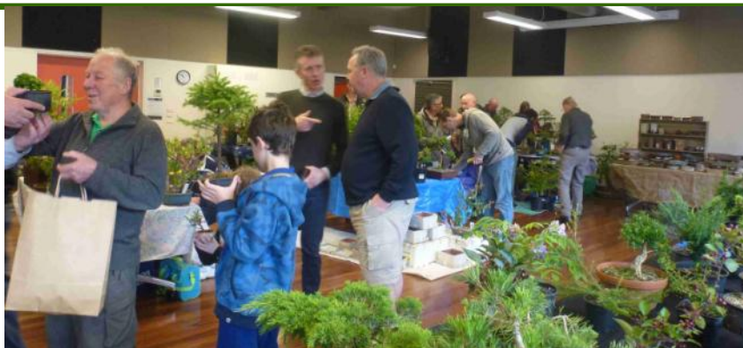
Above - Members and visitors alike found much to appreciate (and acquire) at the last Sale Day.

Following the Sale Day, our normal end of the month Saturday Workshop will also be held at the Japara House venue - there will be no charge for admission and all members and visitors are encouraged to come along, work on their trees and/or just socialize, and receive experienced advice if required.