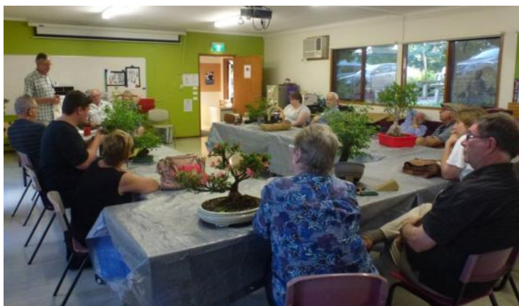
Above - Bonsai Basics presentation at the January workshop meeting.