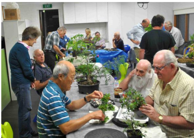
Above - a busy night at the January meeting.

Lindsay explained that the terms were largely interchangeable, but in particular pruning refers to major cuts for styling purposes, and pinching and trimming refers more to minor cuts for ramification or fine styling.