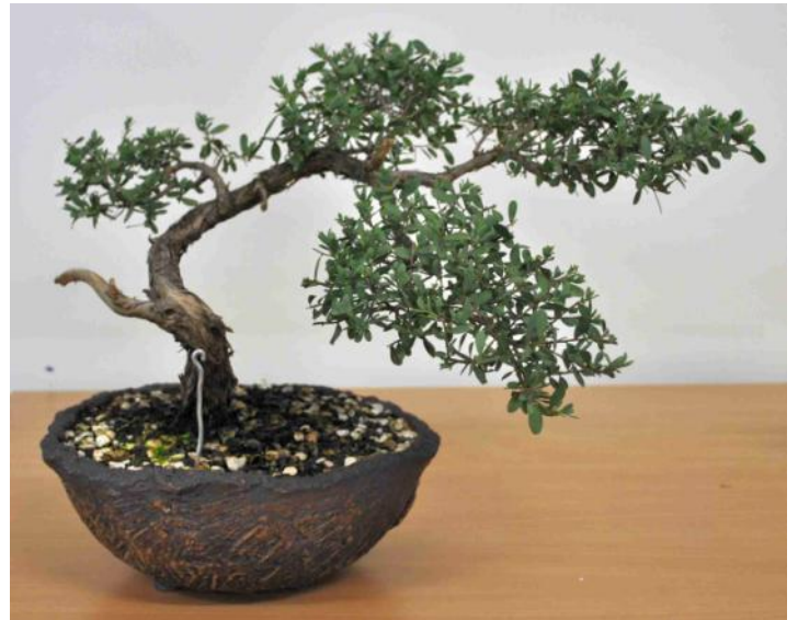
A selection of trees on the Display Table at the January and February meetings.