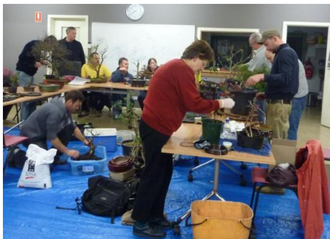
Above—Hard at work at the Intermediate Workshops!