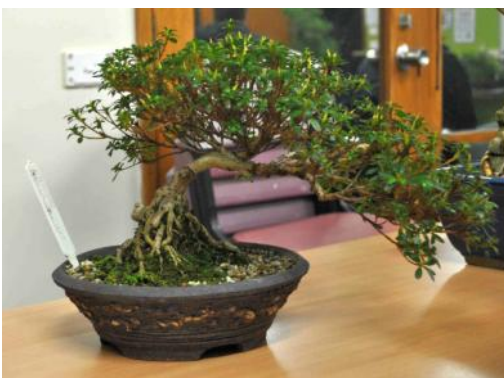
A selection of trees from the July and August Display Tables. (Centre Tree is a sub-miniature 30mm tall, enlarged photo to show detail)