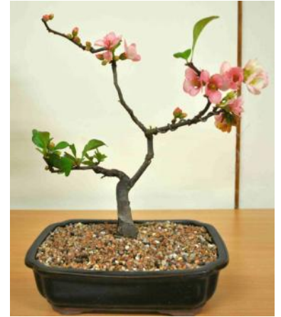
A selection of trees on the Display Table at the July and August meetings.