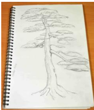
Right - Michael Simonetto hard at work on the demonstration cedar. Left - Michael advocates producing a sketch of the intended design before starting work.

Old cedars need minimal maintenance, but young trees need consistent wiring to set branches in position as they have a tendency to spring back when released. Back-budding is practically non-existent, so protect the inner growth on branches!