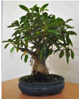
Below - shohin size bonsai photographically enlarged.