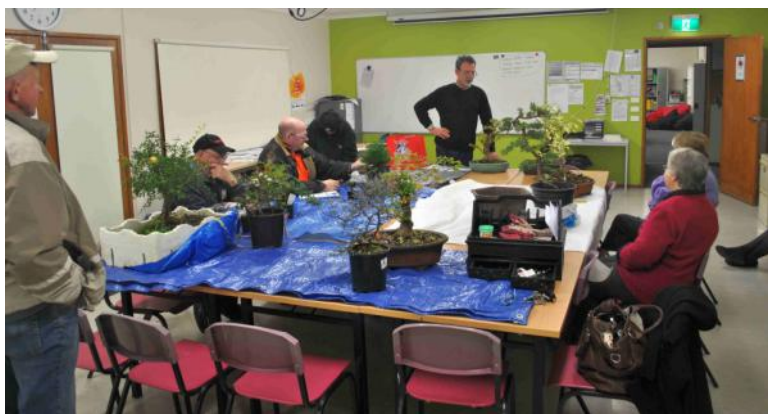
Right - The first night of the Novice Course.