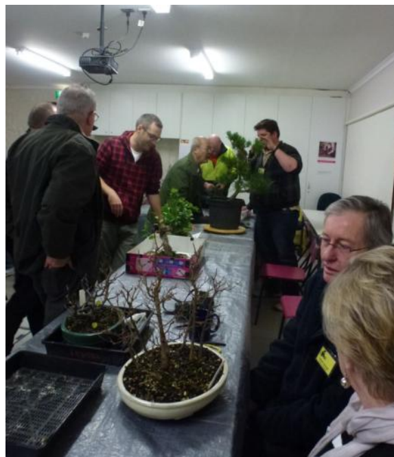
Left and Above - Workshop night at the June meeting.