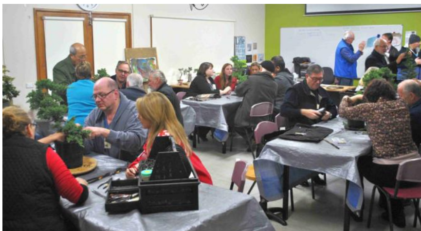
Above - All 5 teams hard at work at the June Team Challenge.