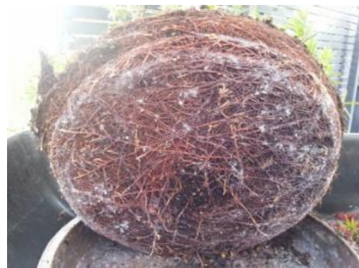
Above - infested root ball. Below - clearly visible within the root ball.

In summary, I have found these critters in mostly my Melaleuca's and Callistemon's, but have found it in my exotics as well. It has been present in Plums, Crab apple, Pyracantha's, Elms, Radiata Pine, Italian Alder, Maples, Figs.