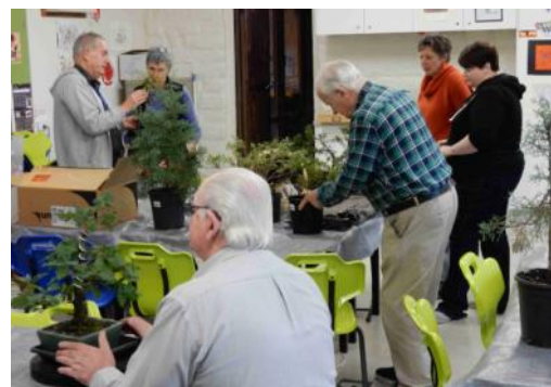
Above - Members at work at the May Saturday Workshop

Many present club members were first introduced to the Club through dropping in to a Saturday Workshop, and we hope that this continues into the future.