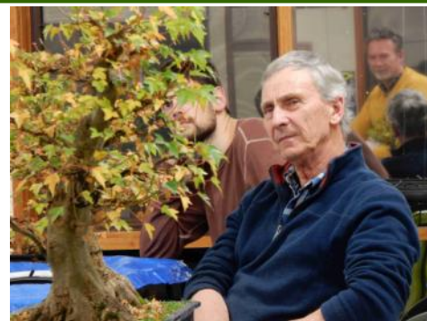
Above - the first night of the Novice Course

The total cost is $100, very reasonable on a per hour basis. Contact Marlene mjerlitschka@iprimus.com.au to book your place,