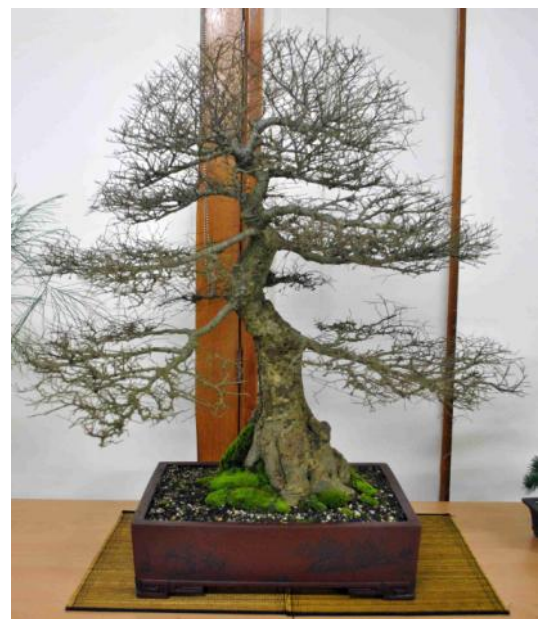
A selection of trees on the Display Table at the May and June meetings.