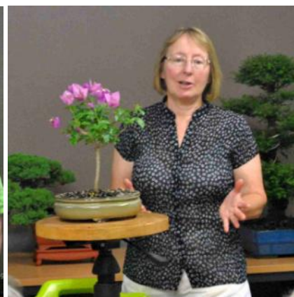
Above - "Show and Tell" at the December meeting.