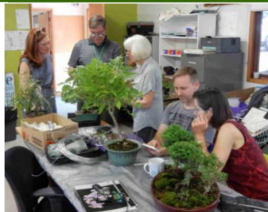
Above - Members at work at the November Saturday Workshop

Many present club members were first introduced to the Club through dropping in to a Saturday Workshop, and we hope that this continues into the future.