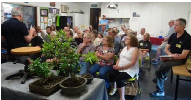
Below - The December meeting.