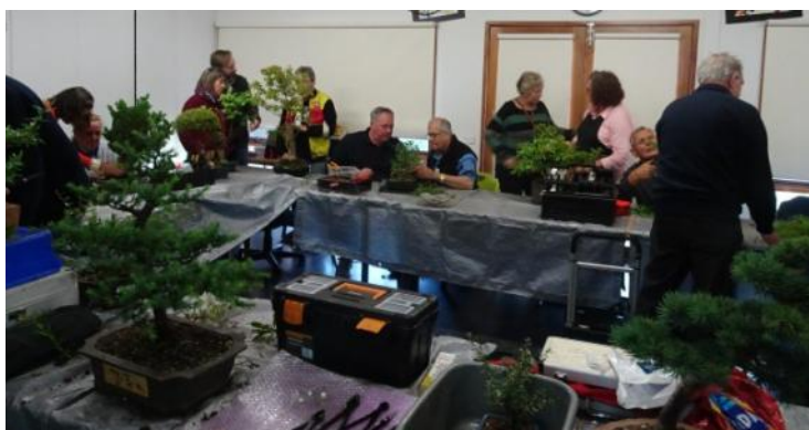
Above - Members at work at the November Saturday Workshop - a bumper turnout!

There is always plenty of helpful and practical advice on hand for those who need it.