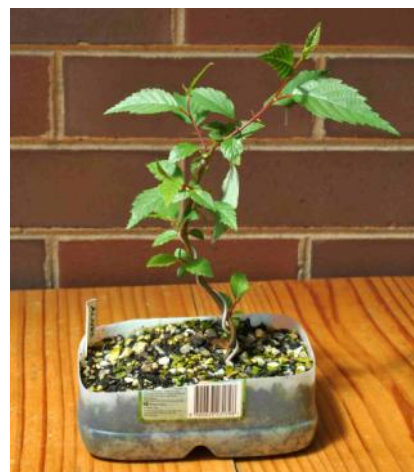
One of the freebie Alder seedlings available at the October meeting - subsequently wired to add some curves in the trunk while it is still young.

Another bonus on the night - more free trees! Margaret S had collected self-sewn seedlings of Alder and Silver Birch from her yard, put them into 'bonsai pots' (actually mainly the cut-off bottoms of milk cartons, and kindly brought them in for the benefit of members. Most interesting was the mini bonsai progression series she displayed, showing how fast the alder seedlings can be developed into very respectable bonsai.