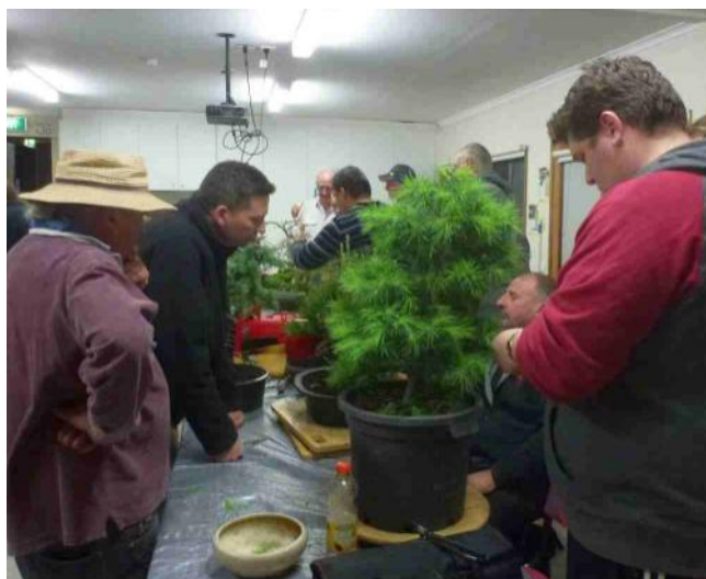
Top - the AGM in September. Middle and bottom - the October workshop.