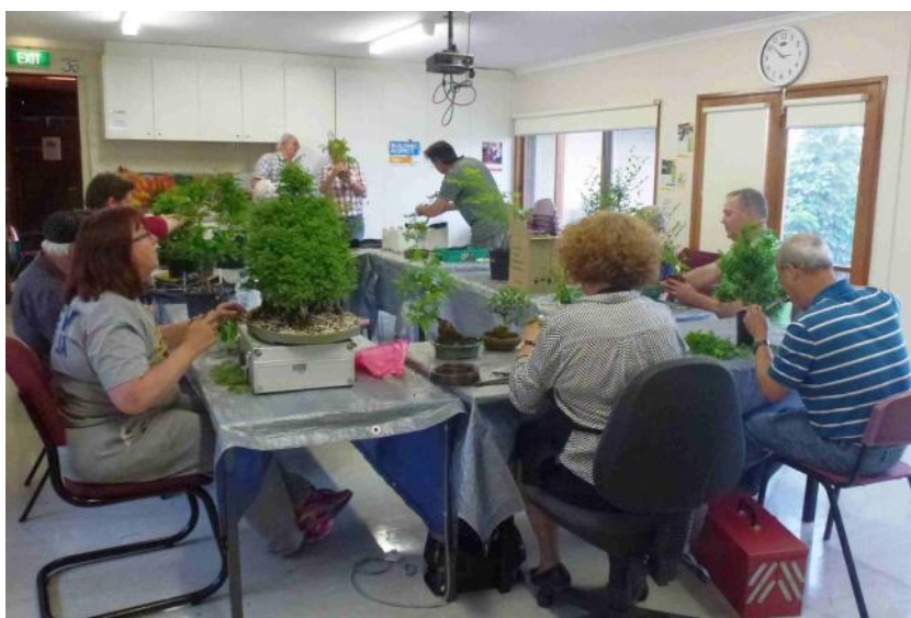
A big attendance at the October workshop - lots of Spring trimming to be done

It is great to see the variety of trees brought along to the workshops, both in the different species and also the different stages of development. All trees (and their owners) are treated with equal respect, whether they are two years old or twenty. There is always something to learn in observing what other members are doing with their bonsai.