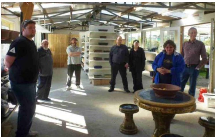
Left - visiting Bonsai Art (purchases already packed away!)