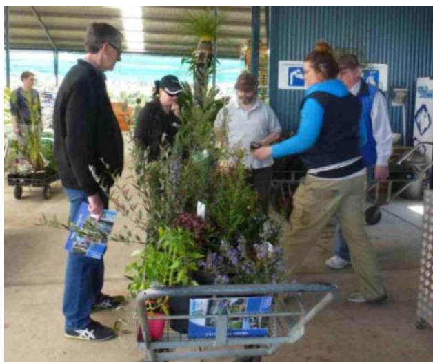
Above - one of the loaded trolleys at Dinsan (there were others as well!)

The additional planned nursery crawl in October, 'Go West', was cancelled and will be rescheduled for January or February, to take coincide with a new shipment of pots at Orient Bonsai. More details soon.