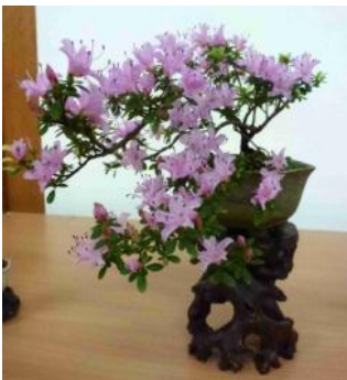
A selection of trees on the Display Table at the September and October meetings. (Shohin and Mame at right)