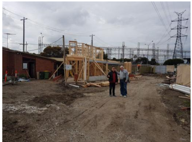
Above - Simon shows Rudi around the Orient Bonsai construction zone.

When re-opened, the new facilities with expanded land area should be spectacular with more space for the nursery including a new display area, water features, and an integrated café on the premises.