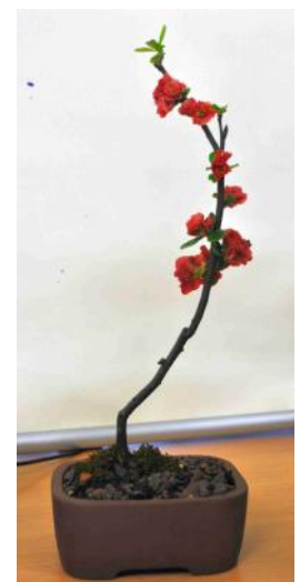
Accent Plants → enlarged for detail