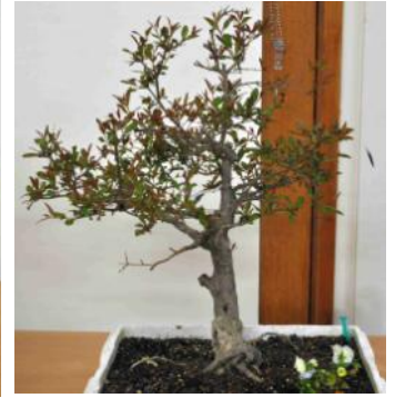
A selection of trees on the Display Table at the September and October meetings.