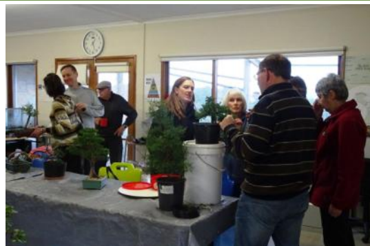
Above - Members at work at the September Saturday Workshop

Many present club members were first introduced to the Club through dropping in to a Saturday Workshop, and we hope that this continues into the future.