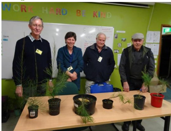
Above - Members displaying progress on their Casuarinas from 2016.

As has become traditional for the AGM, each attending member received a free tree - this year a Coastal Tea Tree ( Leptospermum laevigatum ) tubestock specimen. Discussion ensued on how to wire and twist the trunk while the tree was still young, to produce interesting trunk shapes especially lower down, which can produce a more interesting bonsai as the tree develops.