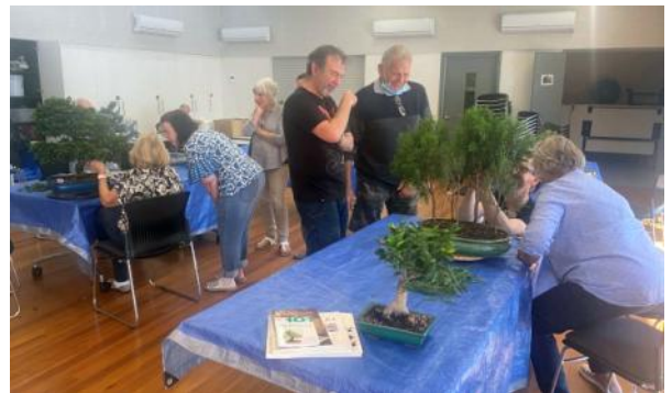
Above - Members at work at the March Saturday Workshop

Visitors are always welcome! Feel free to drop in for a tea or coffee and a look around and a chat. We are now able to open kitchen facilities again, and masks are no longer compulsory indoors!