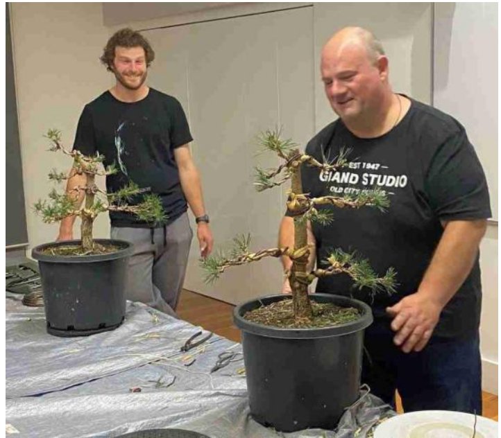
Above - Placing the branches into position to form the basic structure of the design.