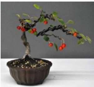
A selection of trees on the Display Table at the March and September meetings.