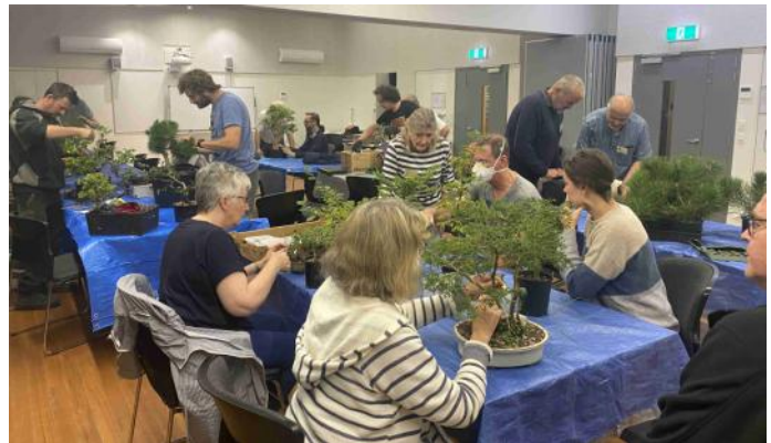
Above - Members hard at work during the workshop at the March meeting.

The March meeting was a general workshop night where attending members were busy working on their trees, with assistance or advice from others when required.