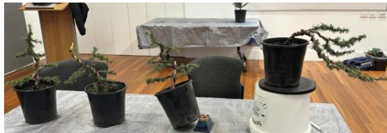
Above - Teams frantically styling their trees to beat the time clock!

Team members had the option of buying their creation at the end of the night, and all trees were