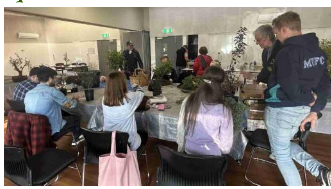
Above - Members at work at the Saturday Workshop

Open from 1:00pm to 4:00pm on the last Saturday of each month except December, at the Chirnside Park Community Hub.